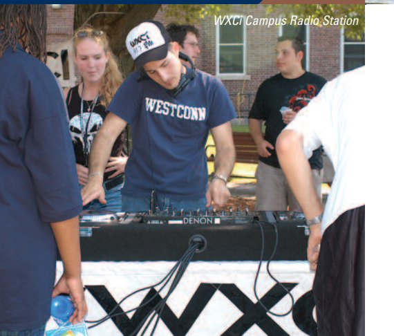
WCXI Campus Radio Station