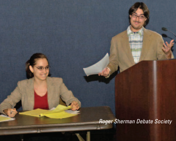
Roger Sherman Debate Society