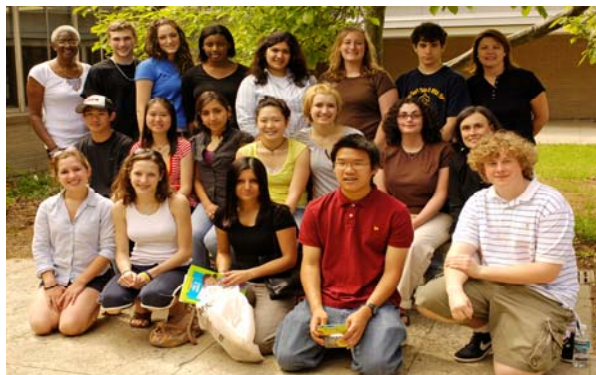
HSO students and Bethel High School AP/Honors Students at Hord Academy in Danbury.