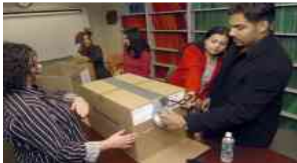
Students from the HSO and the Muslim Student Association Pack Boxes for Pakistan Relief