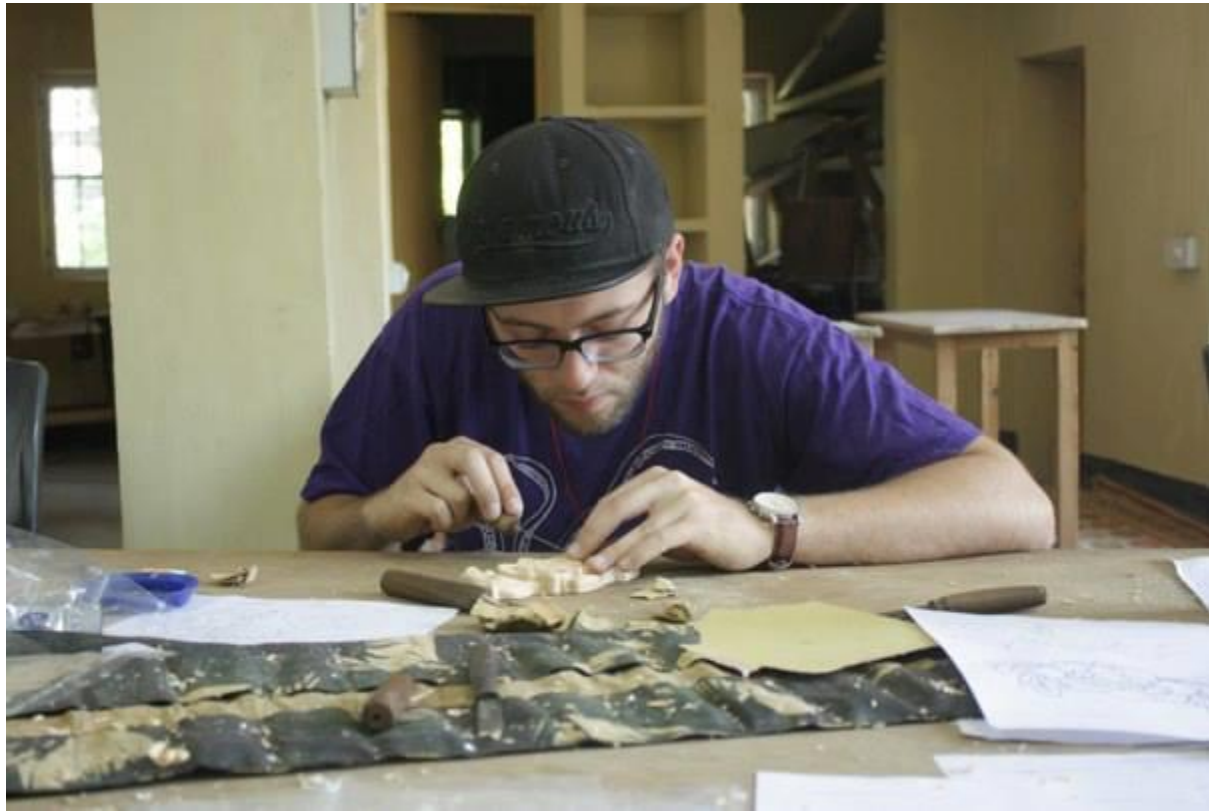
Student doing woodworking