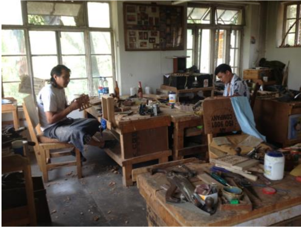
Norbulingka Woodworking Studio