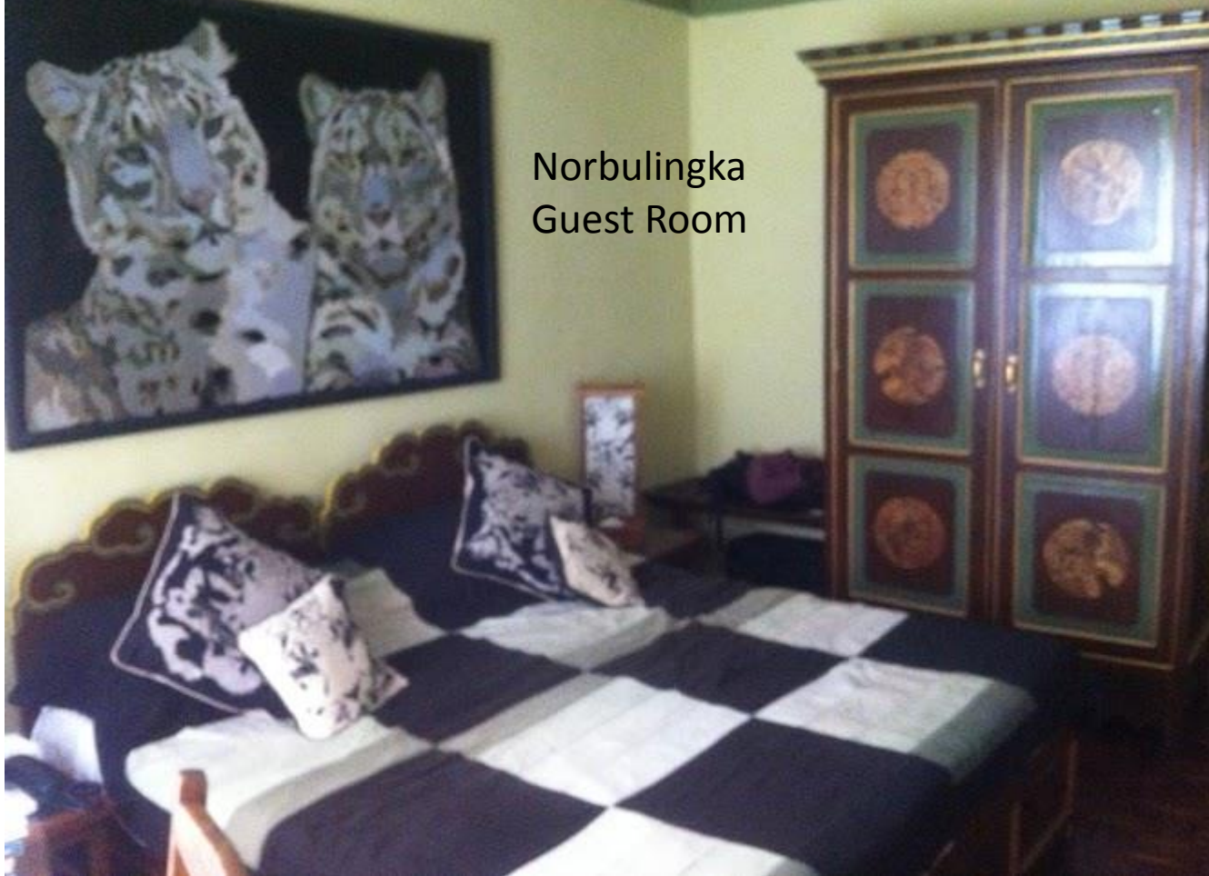
Norbulingka Guest Room