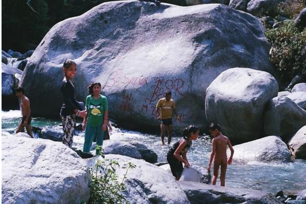
The river swimming site below a woods and temple sacred to Shiva.