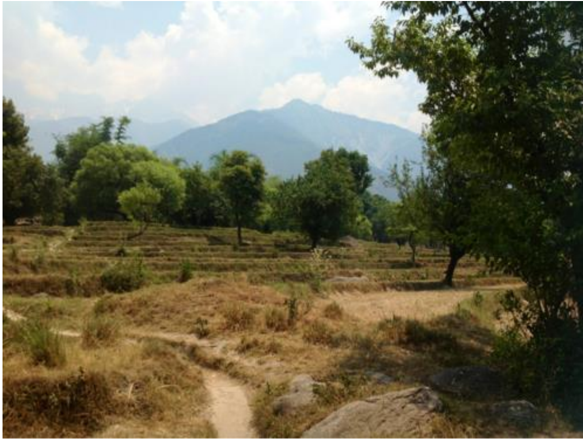
Terrace farming in Sidhpur.