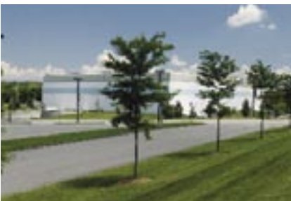
The O'Neill Center