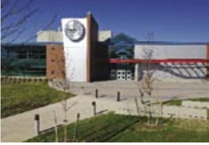
Westside Student Center

Western Connecticut State University , founded in 1903, is just a one-and-a-half hour journey from New York City, three hours from Boston and a short, spectacular drive to skiing in Connecticut's beautiful Northwest Corner! . Campuses WestConn's two beautiful campuses, only a few miles apart, are distinctly different. Our 34-acre Midtown campus evokes both our 100-year history and our 21st century commitment to the future. Students stroll pleasant pathways across a center green; classroom buildings are only a short distance from parking garages and residence halls. And just off campus, small shops and fine restaurants are a short walk away. Courses also are offered at WestConn at Waterbury. Westside campus pours on the country charm. Woods and lawn surround the classroom building, residence halls, Westside Athletic Complex, Westside Campus Center, observatory and playing fields. Students commute via our convenient shuttle buses or by car for classes, games and university events. WestConn's new Science Building was chosen Best of 2006 by New York Construction Magazine. It is a state-of-the-art, 122,000-square-foot facility and the first state-funded project to receive Leadership in Energy and Environmental Design, or LEED, silver certification from the U.S. Green Building Council. As such, it is the university's premier example of its proactive focus on maintaining the health of our shared environment.