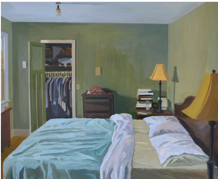
Colleen McGuire The Bedroom | oil on board, 36" x 44"