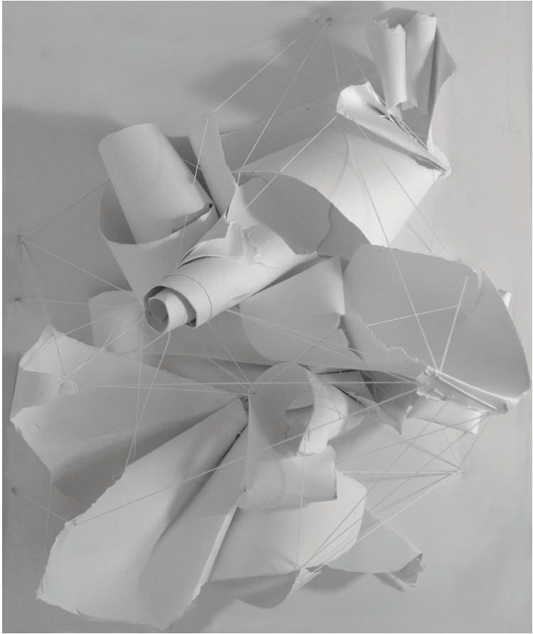
Stacey Kolbig Tie That Binds #2 | mixed media, 29" x 23"