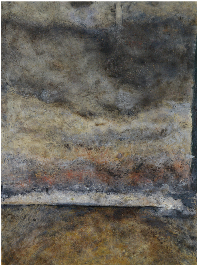
Corinne Speidel Untitled | oil, charcoal and sand on canvas, 48" x 36"