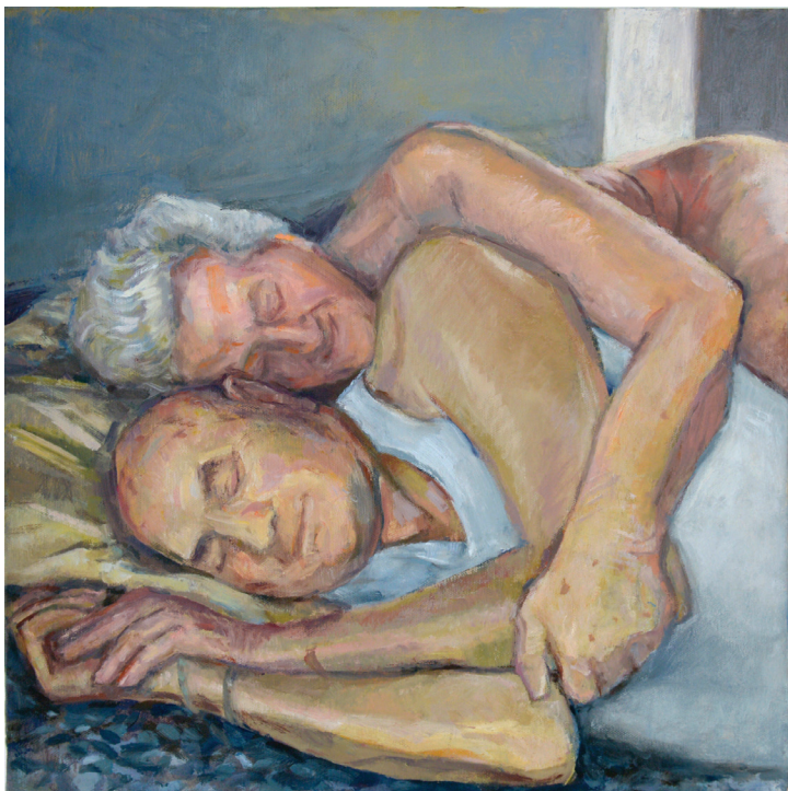
Abbie Rabinowitz Hold | oil on canvas, 16" x 16"