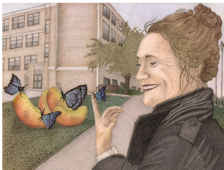
Kanika Khurana Metta (Kindness) #2 | graphite, charcoal and digital on paper, 11" x 14"