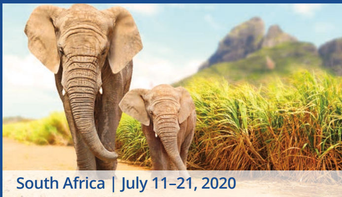
South Africa | July 11-21, 2020