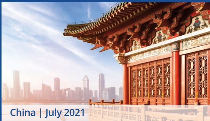
China | July 2021

To learn more and reserve your spot visit pdkintl.org/international-travel/ or call 571-335-0083 .