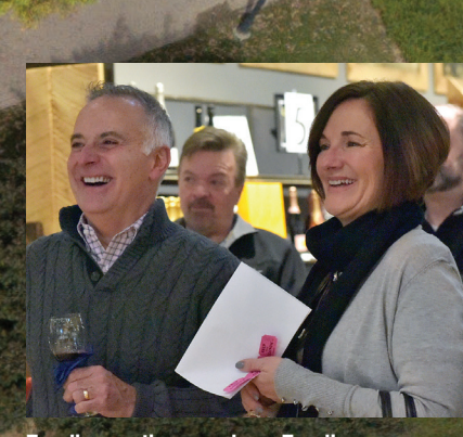
Two line caption goes here. Two line caption goes here.