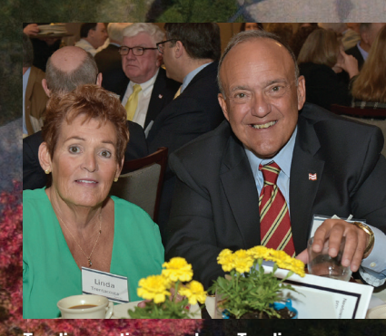
Two line caption goes here. Two line caption goes here.