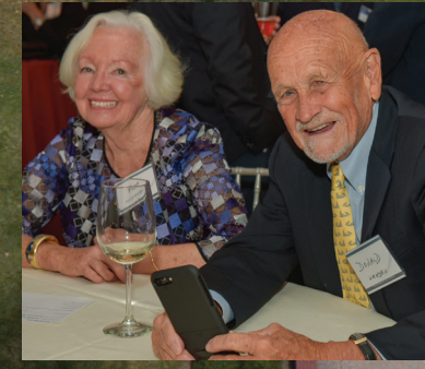
Two line caption goes here. Two line caption goes here.