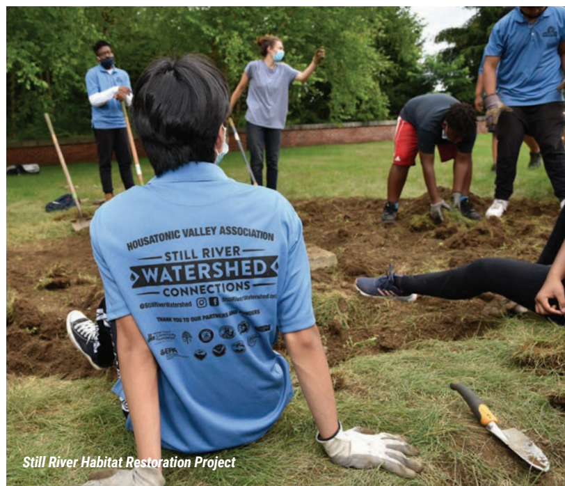
Still River Habitat Restoration Project