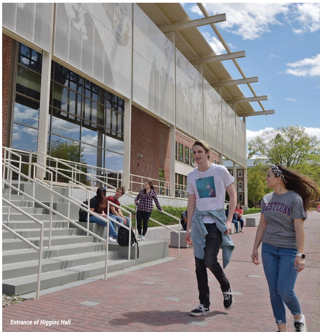
Entrance of Higgins Hall