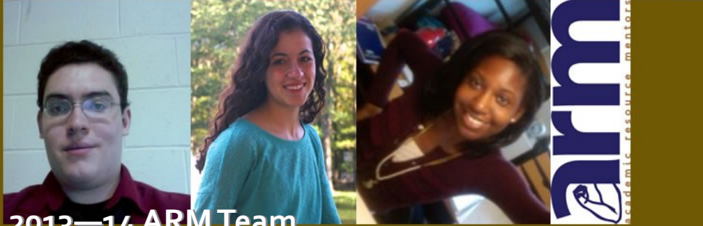
2013—14 ARM Team