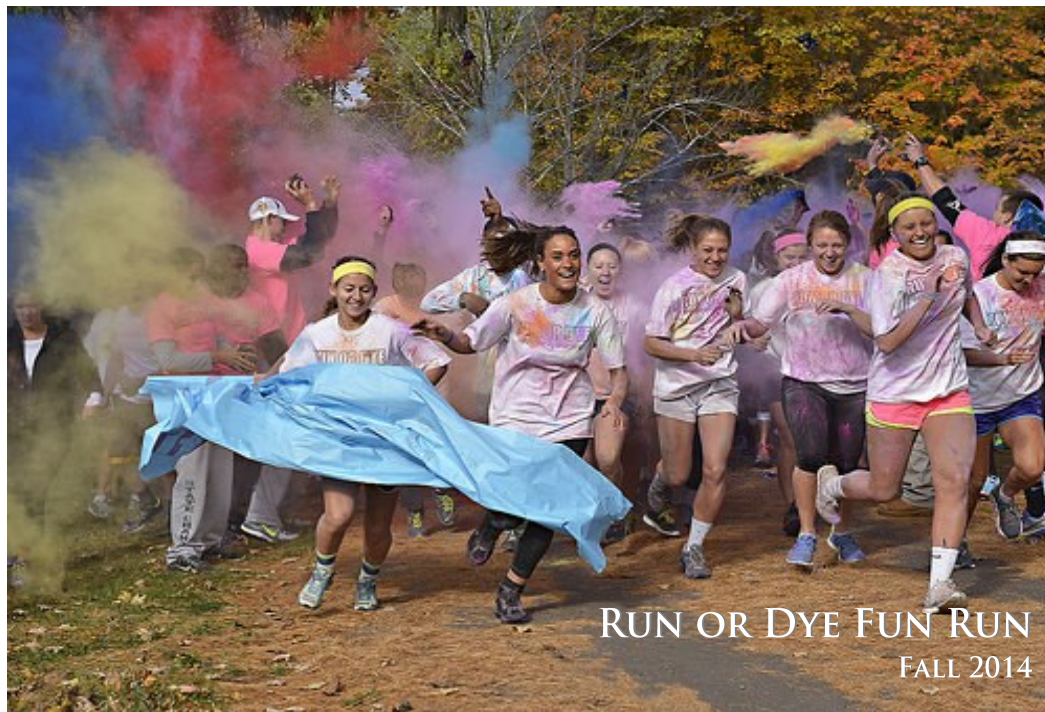
RUN OR DYE FUN RUN FALL 2014

ACADEMIC PEER MENTORS— YOUR ARM HAS A HANDOUT FOR YOU!