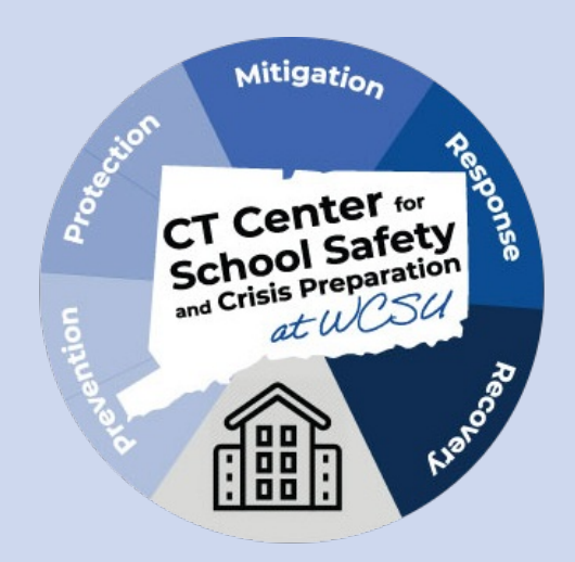
We serve as a school crisis and safety resource to schools across the entire state of CT. Specifically, the mission of the Center is to conduct research, training, and offer technical assistance on student resilience, school crisis, traumainformed schools, and other topics relevant to school safety.