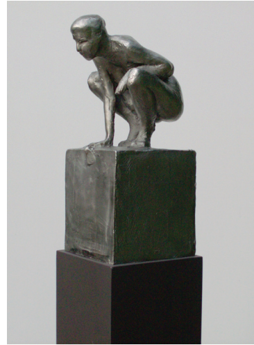
Philip Grausman "Crouching Figure" Stainless steel, 11 x 5 x 6 inches