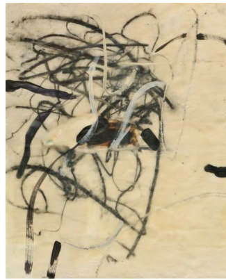
Nancy Lasar "Adagio" Mixed media on rag, 36 x 30 inches