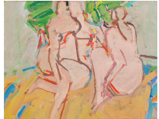
Charles Cajori Untitled Oil on linen, 20 x 26 inches