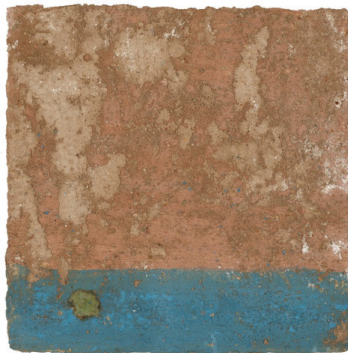
Elizabeth MacDonald "Walls from China" (detail) Ceramic, 63 x 110 inches

October 18 – November 23, 2010 reception October 28, 4 to 7 p.m.