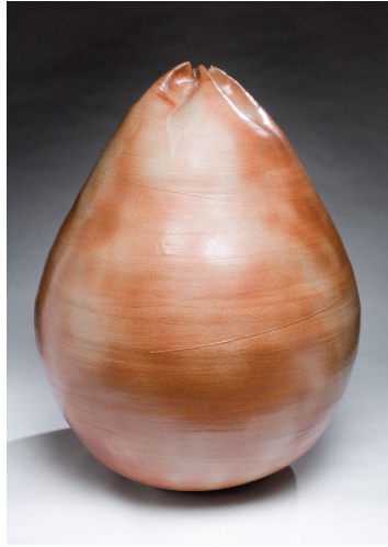
Ann Mallory "Casing No. 38" Stoneware, 27 x 20 x 20 inches