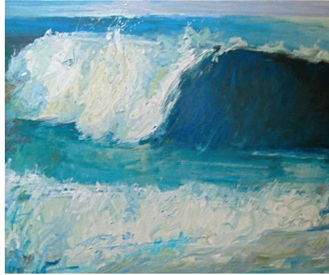
Ira Barkoff "Tumble" Oil on linen, 48 x 60 inches