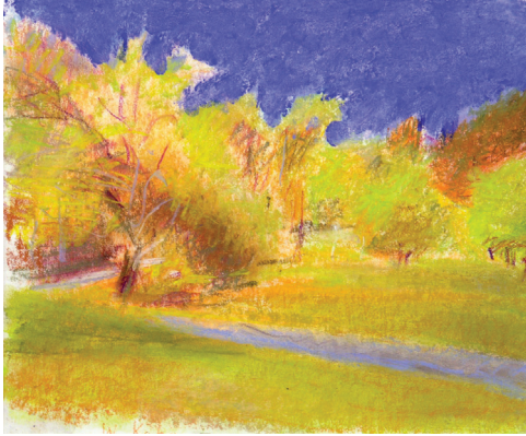
Wolf Kahn "Yellow and Blue" Pastel on paper, 14 x 17 inches