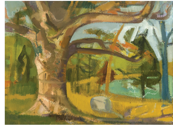
Ruth Miller Untitled Oil on linen, 16 x 20 inches