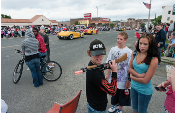
Carl Weese "Fourth of July, 2009, Pittsfield, Mass." Pigment ink digital print, 13.5 x 20.5 inches