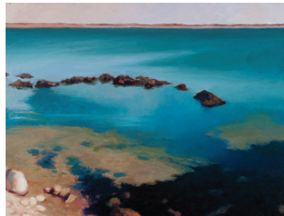
Marija McCarthy "Edge of the Sea" Oil on linen, 22 x 30 inches