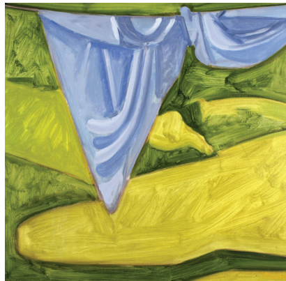
Lois Dodd "Blue Drape, Green Lawn" Oil on masonite, 13 x 14 inches