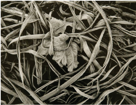
Judith Petrovich "Embrace" Silver gelatin print 11.5 x 14 inches