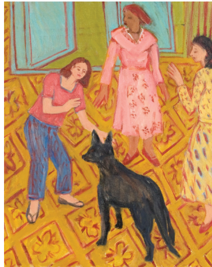
Barbara Grossman "Lost Dog II" Oil on linen, 30 x 24 inches