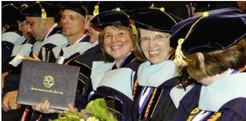
(left): Students have reason to celebrate.