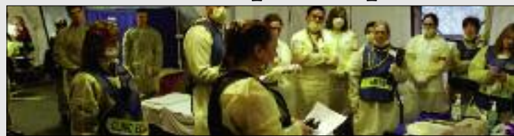
Participants received a real-time orientation as the pandemic drill was about to get underway.