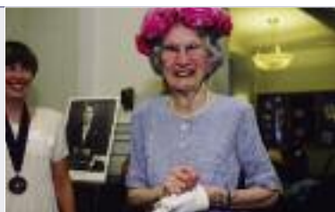
Reminiscent of the 2002 Centennial Tea, Fairfield Hall's history will once again be celebrated with a tea when the newly renovated residence hall reopens this fall.

Starting this fall, the main part of the building will house female students and the