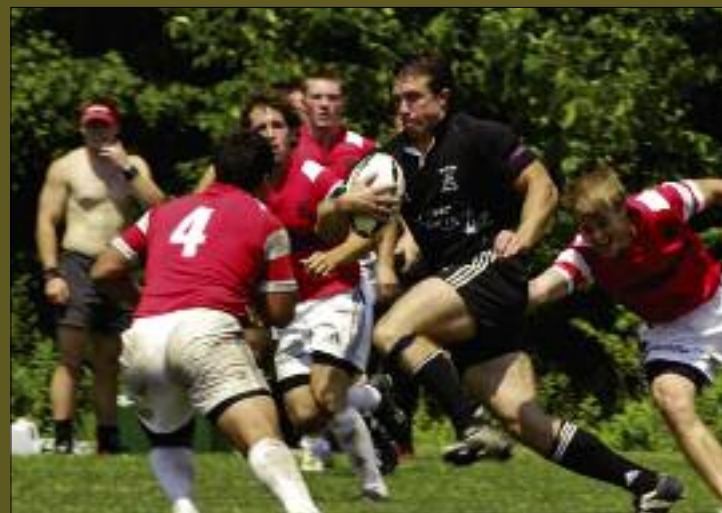
Athletes from all over the state of Connecticut converged on Danbury for the Nutmeg Games this summer. A number of events were held on WestConn's Westside campus. ■