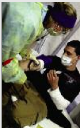
A first-year WCSU student nurse takes the vital signs of a mock patient in the mobile field hospital.

More than 30 nursing students from WestConn participated in the region's first exercise to test preparedness for an outbreak of pandemic influenza.