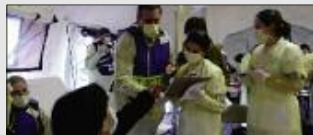
Student nurses interacted with state and local agencies.